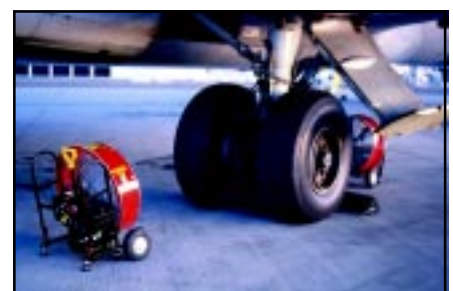
Top: Tunnel ventilation.